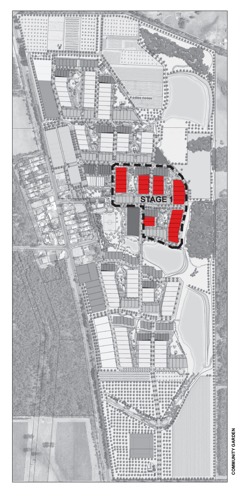
Location Plan - Family Lots (Stage 1)