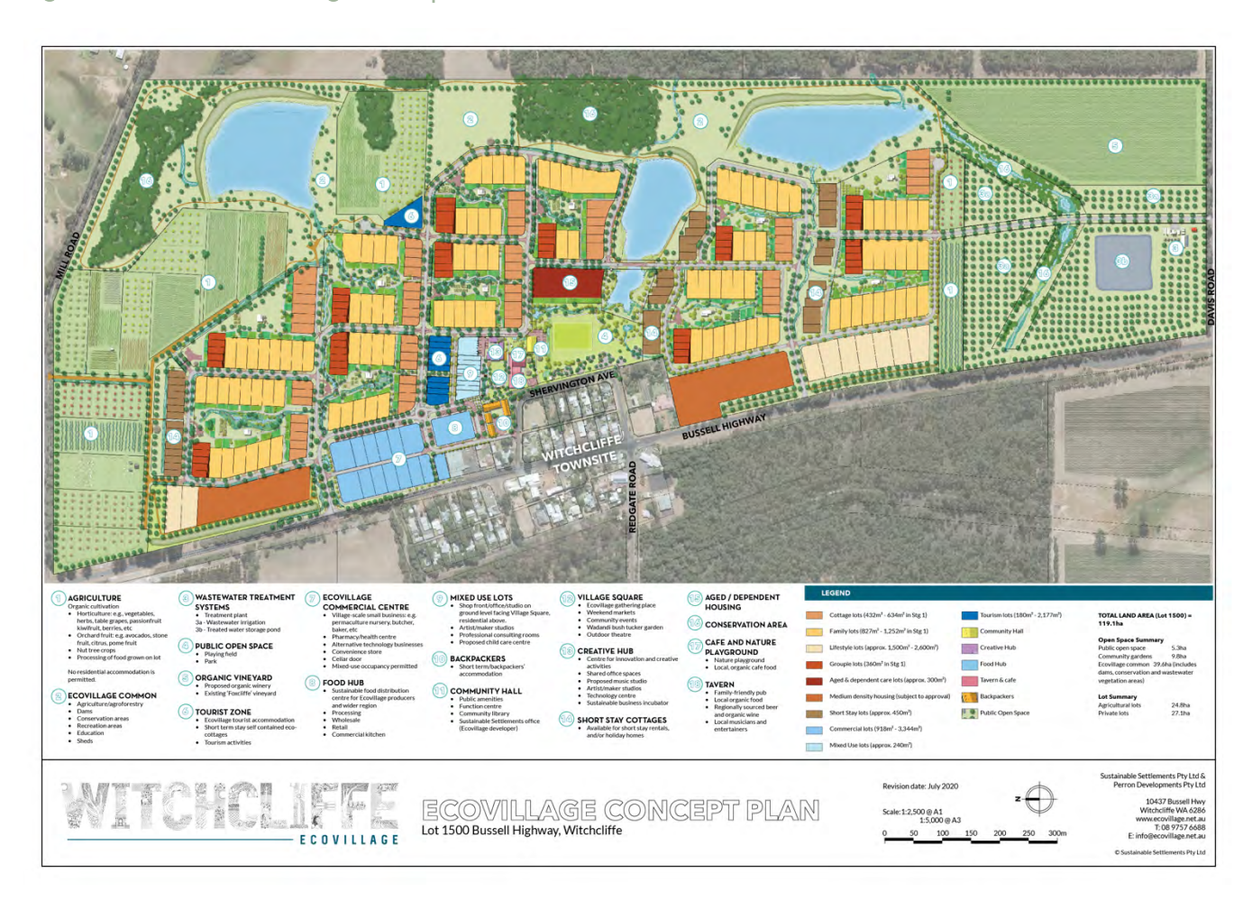
Figure 1, Witchcliffe Ecovillage Concept Plan

This handbook provides information for potential purchasers about the Ecovillage's ownership structure, land and asset management responsibilities, and ongoing fees.