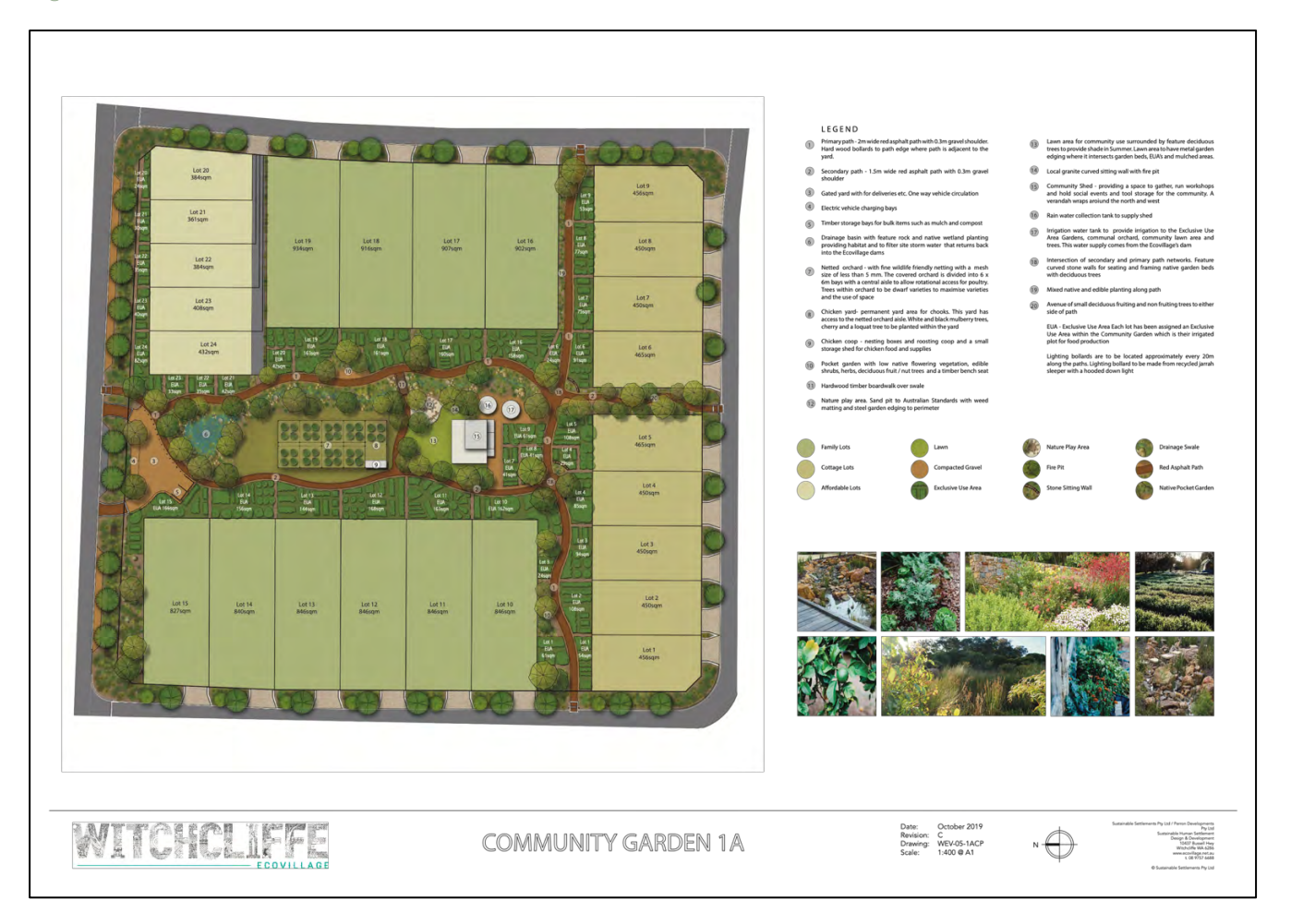
Figure 2. Cluster 1A