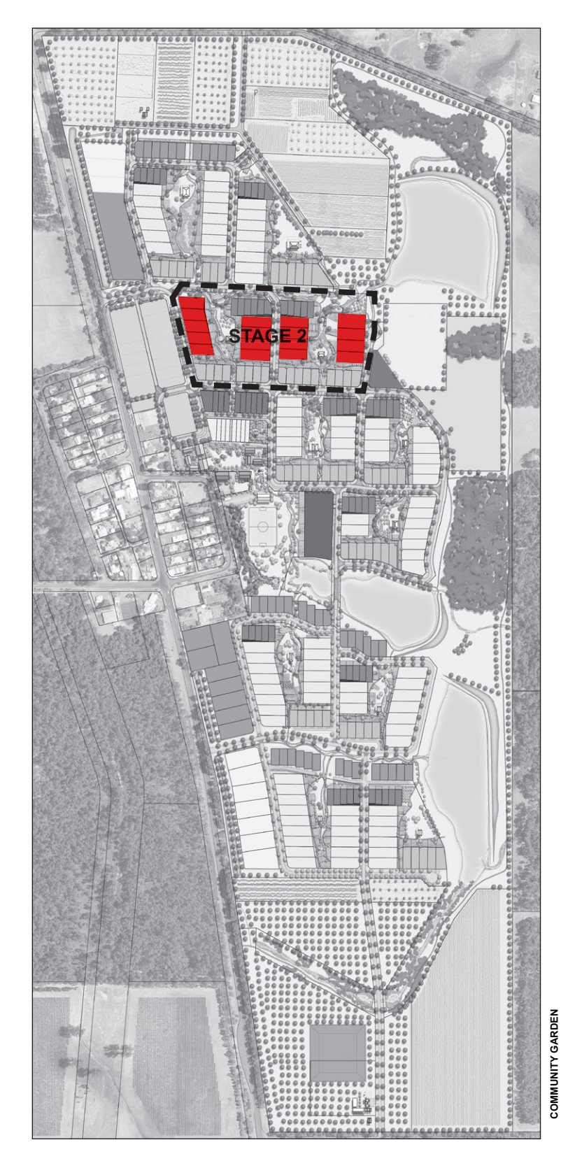
Location Plan - Family Lots (Stage 2)