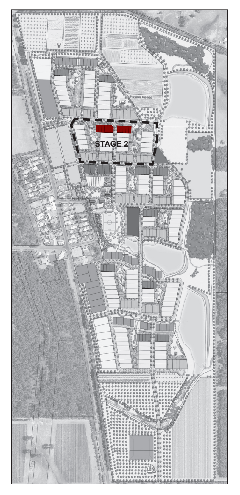
Location Plan - Groupie Lots (Stage 2)