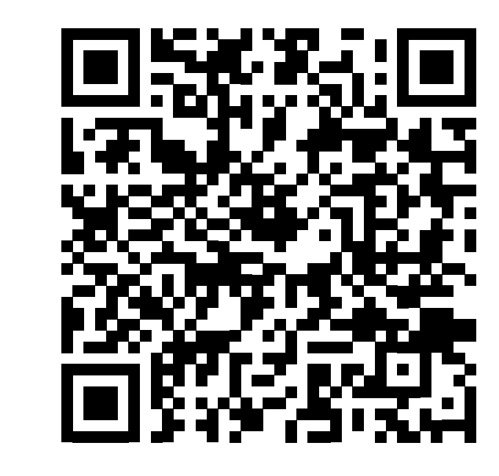
Scan this QR code to see which lots are still available for sale.